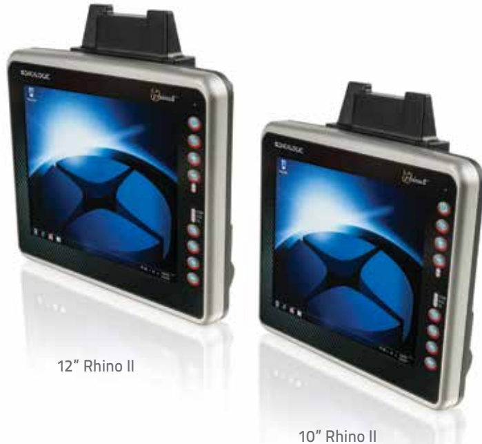
12" Rhino II

NOTE: The Android robot is reproduced or modified from work created and shared by Google and used according to terms described in the Creative Commons 3.0 Attribution License.